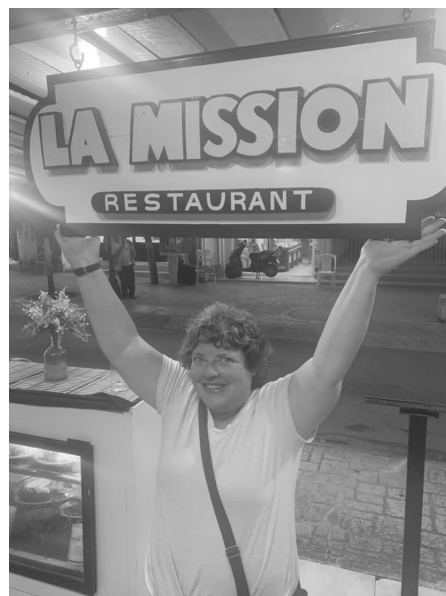
Cozumel Mexico 2023

The leftovers reheat well. Just wrap a slice in foil and bake in a 375 degree oven for 15-20 minutes.