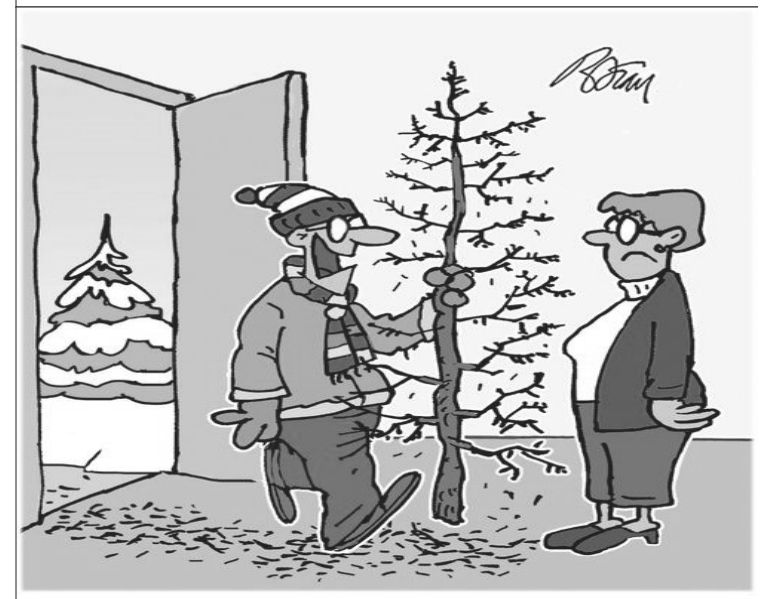
"THE NEW TREES WERE TOO EXPENSIVE, BUT I GOT A SWEET DEAL ON THIS USED ONE !"

To you and yours, from all of us here at STAR, we say "Merry Christmas!" "Season's Greetings!" and "Happy New Year!"