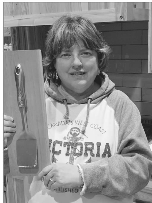
Golden Spatula Award Second Place

Serve in bowls. Top with cheese and corn chips if desired. This is also great over baked potatoes or take with you camping for chili burgers, or chili dogs.